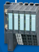
MICRO PROFINET IO-Controller