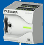
MICRO PROFINET I-Device